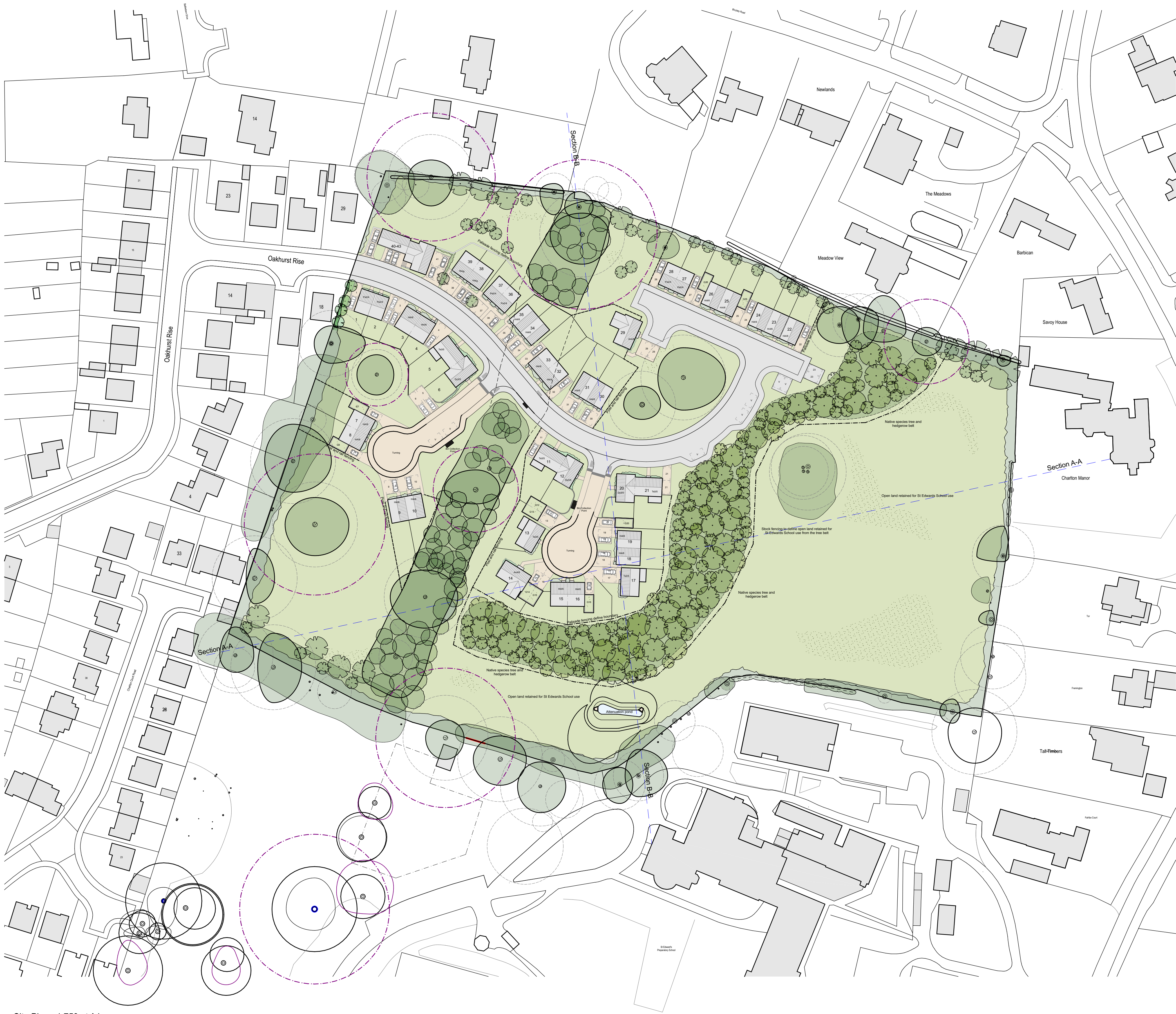
Site Plan - 1:750 at A1